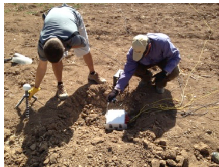
Photos depicting geophysical field equipment, deploying MT devices, and resistivity image of the Jemez geothermal system in northern New Mexico